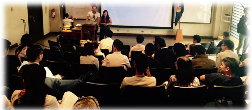
Network of Young Democratic Asians (NOYDA) Conference in Manila, The Philippines, April 2016