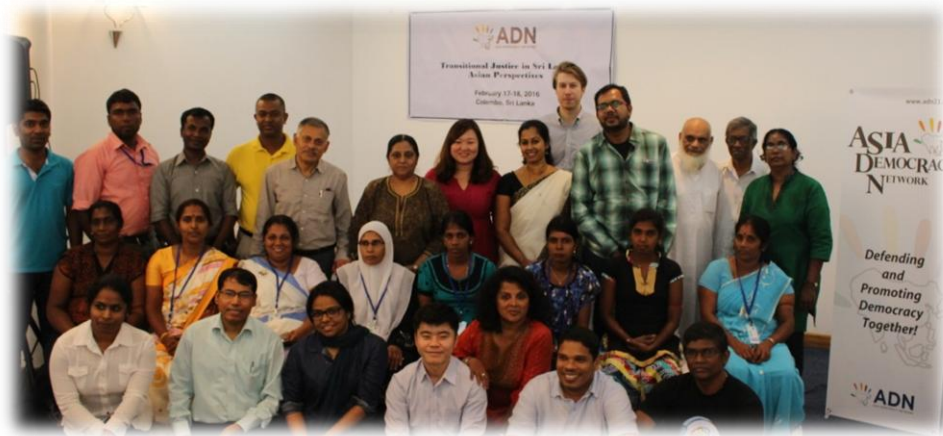
International Conference on Transitional Justice in Sri Lanka: Asian Perspectives in Colombo February 2016.